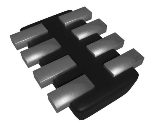
Figure 2. Example of SOT-583 DYC Package