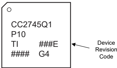
Figure 2-1. Package Symbolization