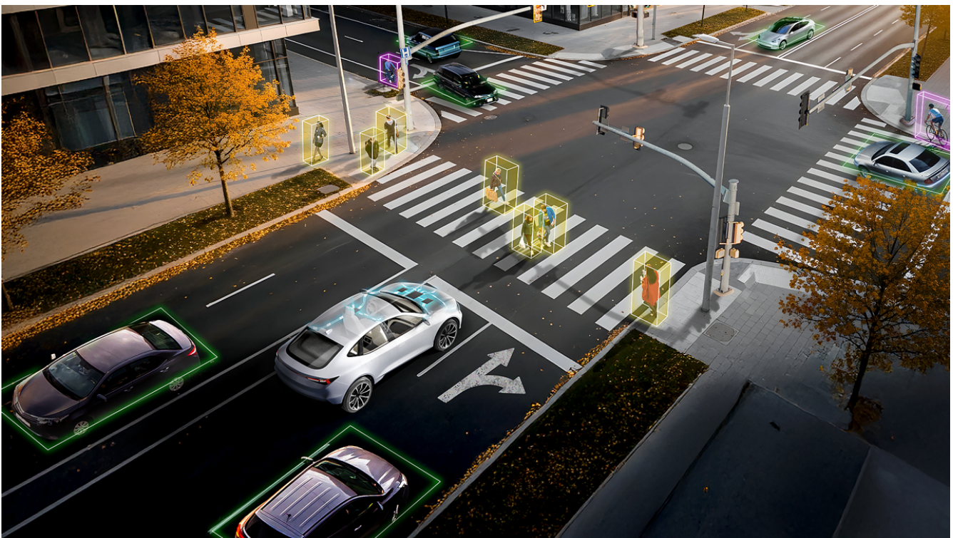
Figure 1. Visualization of ADAS features for autonomous driving in a software-defined vehicle analyzing environmental data

The automotive industry is ascending to higher levels of vehicle autonomy with the help of central computing platforms. SoCs like the TDA5 family offer safe, efficient AI performance through an integrated C7™ NPU and chiplet-ready design. These SoCs enable automakers to more easily implement ADAS capabilities, bringing premium features to all types of vehicles, from base models to luxury cars.