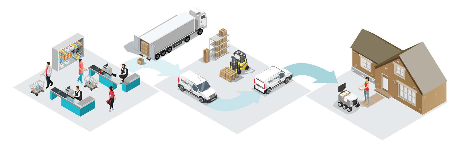
Figure 1. Omnichannel retail.