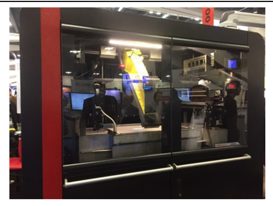
Figure 2. The Prodways ProMaker L5000 3D printer at Photonics West