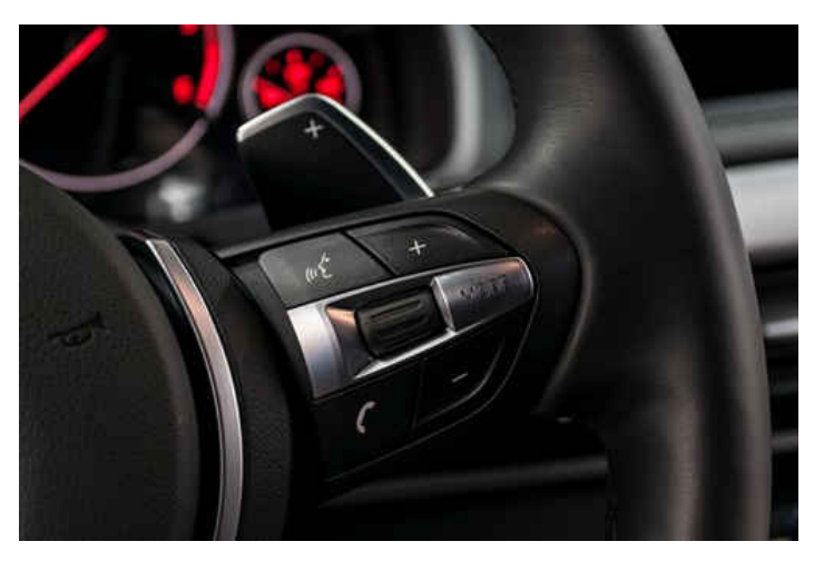
Figure 1. Example of a Hands-free System

I am sure you can relate when you must take a phone call through a hands-free system while driving. You want to make sure that the person on the line can hear you clearly, and you expect (hope?) that the system rejects noise like air-conditioner airflow, wind noise and road noise inside the cabin. What you need from the car in that case is called noise discrimination.