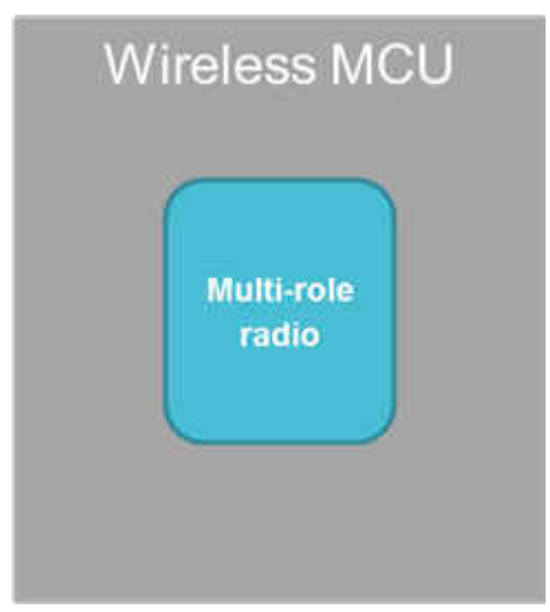
Figure 2. Bluetooth® low energy Wireless MCU Without and With Multi-role

Q: Now I Can Visualize the Importance of This Feature. Last Question, If I Want to Implement Multi-role into a Design Today, Which Device Would You Recommend and Why?