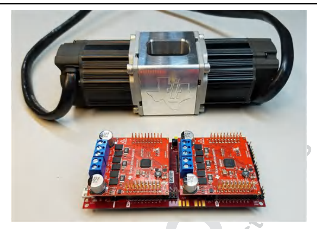
Figure 4. A Low-cost, Shunt-based Sensing Bundle for Motor-control Performance Testing