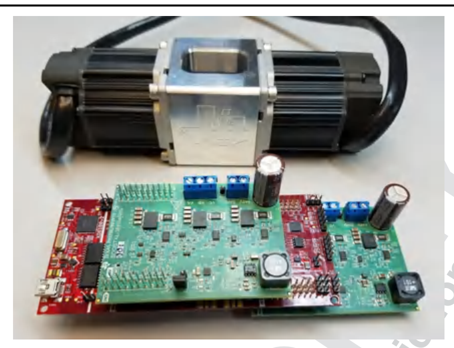
Figure 3. A Low-cost GaN-based Bundle for Motor-control Performance Testing

Available for less than $600, this is the same configuration that produced the test results shown in Figure 2. The inverter BoosterPack development boards included in this bundle also include the in-phase current sensing, and therefore enable double sampling of the current per PWM period.