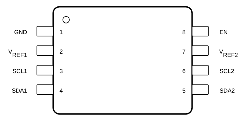
Figure 4-1. Pin Diagram

Figure 4-1 shows the TCA39306-Q1 pin diagram. For a detailed description of the device pins, please refer to the Pin Configuration and Functions section in the TCA39306-Q1 data sheet.