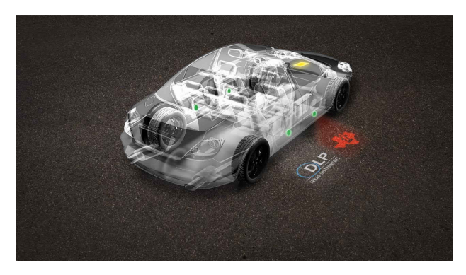
Figure 1. Exterior small light replacement architecture requirements.

Our exterior small light replacement architecture is the simplest and most cost-effective solution. This solution inspired the DLP3021LEQ1EVM and DLP2021LEQ1EVM electronics designs and is meant to serve as a replacement to existing small lights. The only input signals required for modules with this architecture are power rails and this solution displays content almost instantaneously after power is supplied. While this solution is ideal for someone looking to replace a puddle light, the flash memory in the system cannot be updated without the module being removed from the car. If dynamic ground projection is only desired for vehicle styling, this architecture is the most cost-effective way to enable dynamic projections. Figure 1 highlights how DLP technology can generate images, without being connected to the vehicle's ECU. The module position is shown by the green dots, and the ECU is highlight in vellow at the front of the car. While this image shows the DGP modules mounted in the doors, these modules can be mounted anywhere in the car as long as power rails are accessible. Both the DLP3021-Q1 and DLP2021-Q1 DMDs can support this architecture.