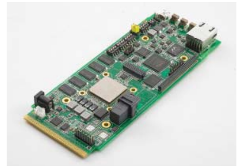
▲ Figure 2. TMS320C6678 Lite Evaluation Module

TI provides a full suite of best-in-class Eclipse-based development and debug tools for the C667x and C665x devices, including a new C compiler, an assembly optimizer to