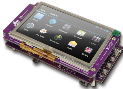
▲ AM335x Starter Kit

The AM335x Cortex-A8 Arm MPUs are sampling today, available at www.ti.com/am335x . Development is easy and can begin in minutes with TI's all-inclusive