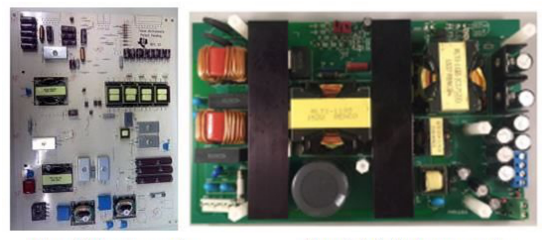
Figure 3: TV power supply

The following image displays the form-factor-compliant High Efficiency 350W AC/DC Power Supply Reference Design for industrial power supplies. Here is a space-constrained design that looks more like downtown Dallas than a low-cost two-layer PCB layout. Having a single combo controller to which signals are routed is no different than wanting a single massive parking lot catering to the whole of Manhattan fed by single-lane alleys ... good luck getting in and out.