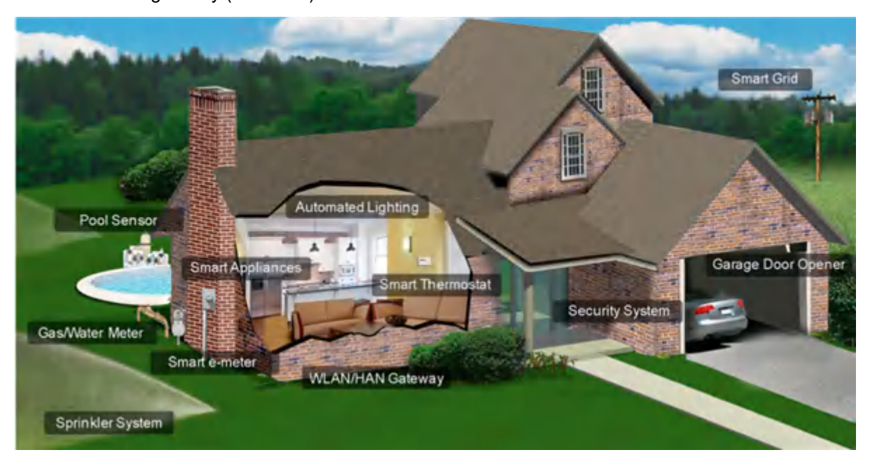
Figure 1. Example of a Smart Home

Advancements in wireless connectivity and low-power embedded processing technology have enabled new applications for smart homes and buildings. Of course, most smart home systems have a control panel or base unit in a fixed location that plugs into the AC power system. But there may also be a number of distributed (and movable) wireless sensors or cameras that are part of the overall system. These peripheral devices are not always near a permanent power source. Figure 1 shows a typical system with multiple remote peripheral devices and a central gateway (controller).