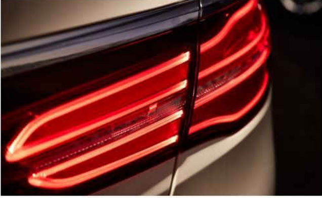
Figure 1. Automotive Head Light and Rear Light

In the past, the way to achieve greater brightness was to increase the number of LEDs. But if you tear down a new rear lamp now, you will see more light guides, light pipes, light shields and other complicated lighting structures to achieve smoother lighting effects. With the changes above, fewer LEDs but higher current of each LED will be required.