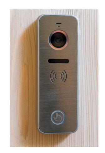
Figure 1. Video-enabled doorbell

Our homes are getting smarter and connecting to the internet with security cameras, thermostats, smart speakers and smart TVs. The video doorbell, seen in Figure 1, is another smart device gaining popularity, providing high-definition images and two-way audio communication so that homeowners can greet visitors from their smartphone. Video, activated by a motion sensor, records activities in the front and back yards, enhancing home security around the clock and through any weather conditions. While most video doorbells are hardwired, many consumers are seeking battery-powered video doorbells when the existing wiring or transformer is out of date or incompatible. A battery-powered video doorbell also provides convenience for renters who can't (or shouldn't) touch the wiring. Such doorbells are easily installed in flexible locations with no wiring needed. Another benefit is that battery-powered video doorbells keep working even during power failures.