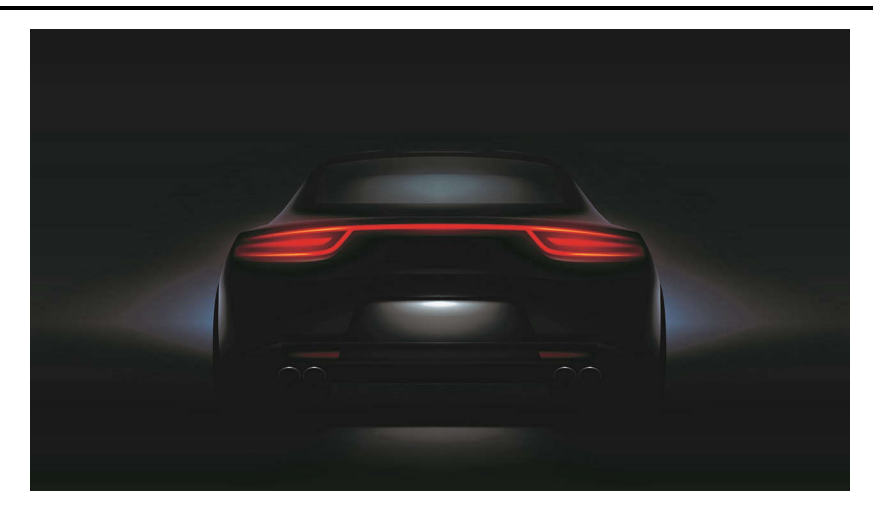
Figure 1-2. Long automotive rear lamp

Automotive rear lamps that extend across the back of an automobile mean long wires across the entire printed circuit board. This presents a significant design issue, because the LED drivers must connect directly to a microcontroller (MCU), with wires in traditional single-ended interfaces for long-distance off-board communication. It is difficult for such a complex architecture to meet strict electromagnetic compatibility (EMC) requirements. Therefore, using an external physical layer transceiver is essential to effectively implement long distance off-board communication for automotive lighting, as shown in Figure 1-3.