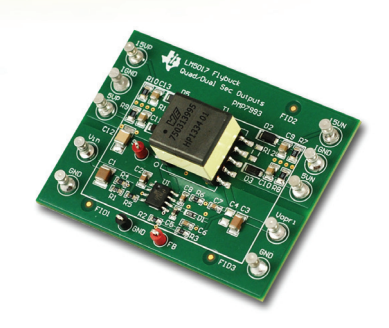
PMP7993.1 board with tiny 40 x 28 mm solution area