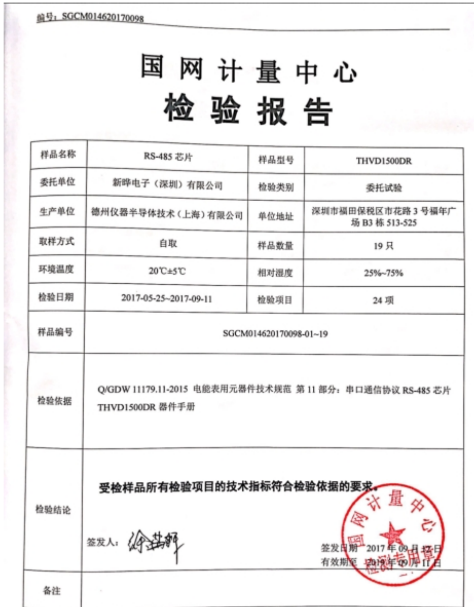
Figure 3. Inspection Report From SGCC Showing the THVD1500 Passed All Tests